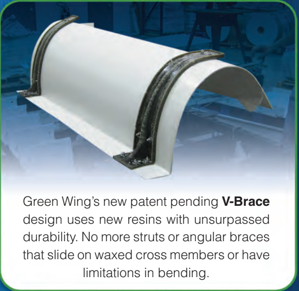
Green Wing's new patent pending V-Brace design uses new resins with unsurpassed durability. No more struts or angular braces that slide on waxed cross members or have limitations in bending.